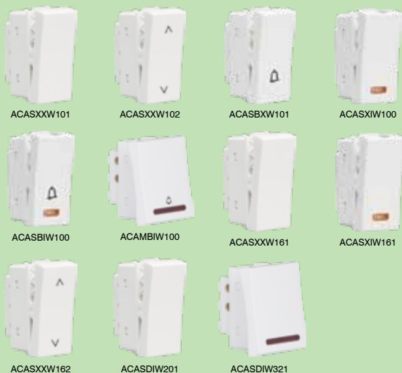
ACASXXW101 ACASXXW102 ACASBXW101 ACASXIW100 ACASBIW100 ACAMBIW100 ACASXXW161 ACASXIW161 ACASXXW162 ACASDIW201 ACASDIW321