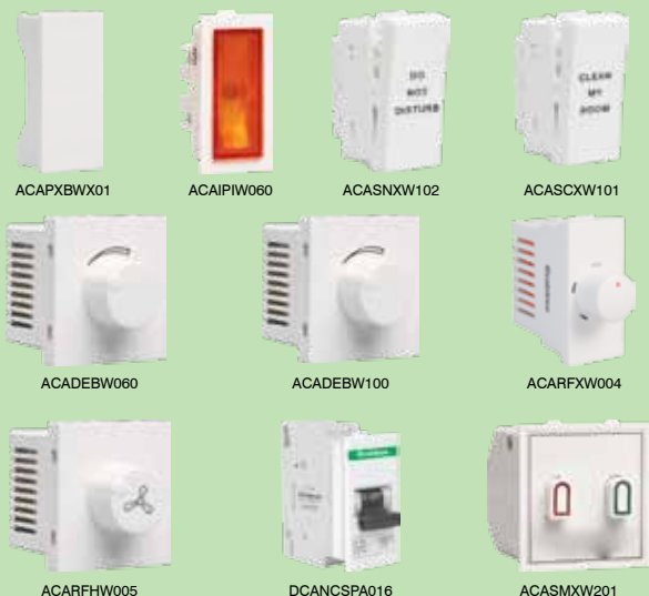
ACAPXBW001 ACAIPIW060 ACASNWX102 ACASCXW101 ACADBEW060 ACADBEW100 ACARFXW004 ACARFW005 DCANCSA016 ACASMXW201