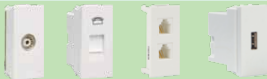
ACAKTOW000 ACAKHAW000 ACAKRTW112 ACAGGXW011